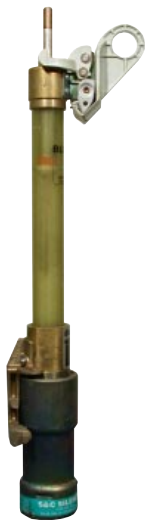
Figure 4. SML-4Z fuse holder.