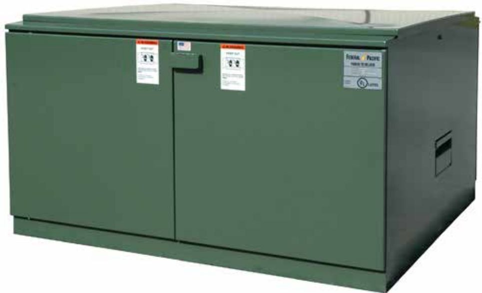
Figure 1 . Federal Pacific now has UL® Listed 15kV and 25kV Pad-Mounted Switchgear in both Dead-Front PSE (pictured) and PSI/II Live-Front Models.

Once again, Federal Pacific's Auto-jet®II switch and fuse interrupters, utilizing puffer-style load-break technology, proved equal to the task, this time at the more demanding 27kV level, while still avoiding the inherent limitations of ablative