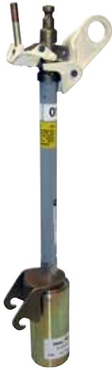
Figure 2. End Fittings with Federal Pacific, Eaton DBU or (as pictured) with S&C SMU-20 Power Fuses.

By obtaining these UL® listings, Federal Pacific has gone more than the "extra mile" to prove its commitment to providing industry-leading, reliable, cost-effective, environmentally responsible pad-mounted switchgear for today's market.